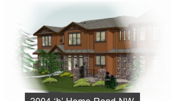
2004 'b' Home Road NW